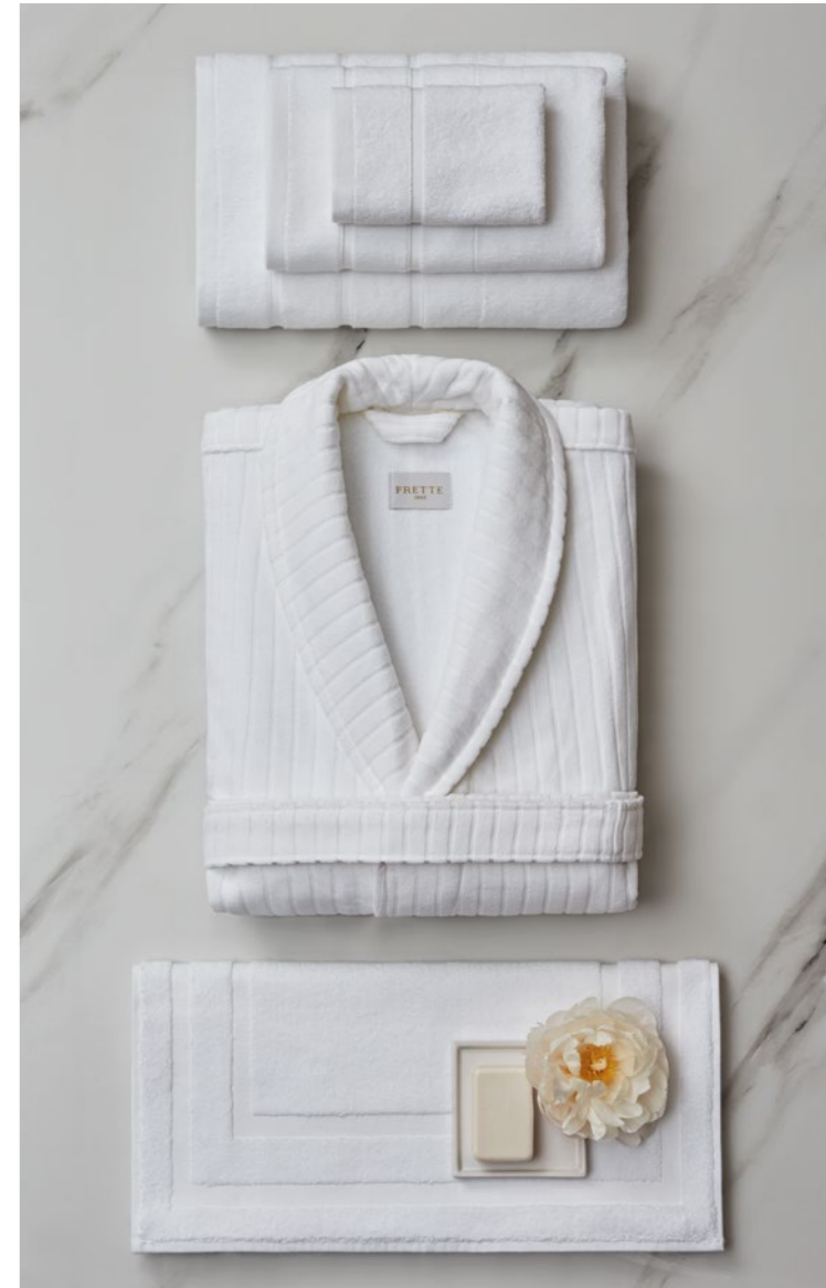
Lanes Towel Set and Bath Mat , 100% Cotton, Double Twisted Terry, Dobby Border, Lanes Design at both ends. White colour. Suite Jacquard Stripe Bathrobe , 100% Cotton. White colour.