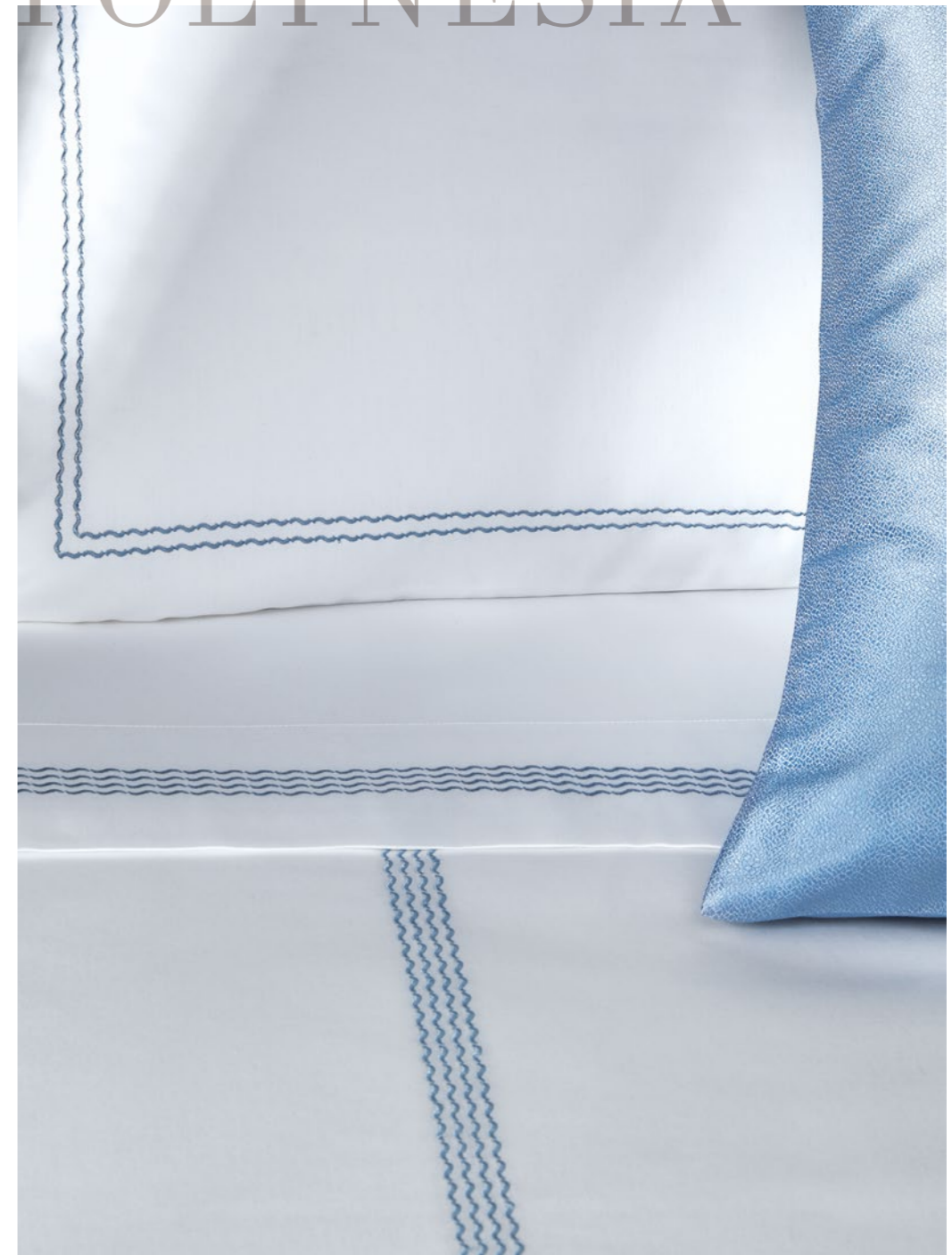
Smeraldo Sateen , Plain Design, 100% Cotton, Mercerized. White colour. Wave Embroidery. Partout Decorative Cushion , 100% Polyester, White/Aqua colour. Lucia Throw , Wool and cashmere throw with fringes on short sides. Aqua colour.