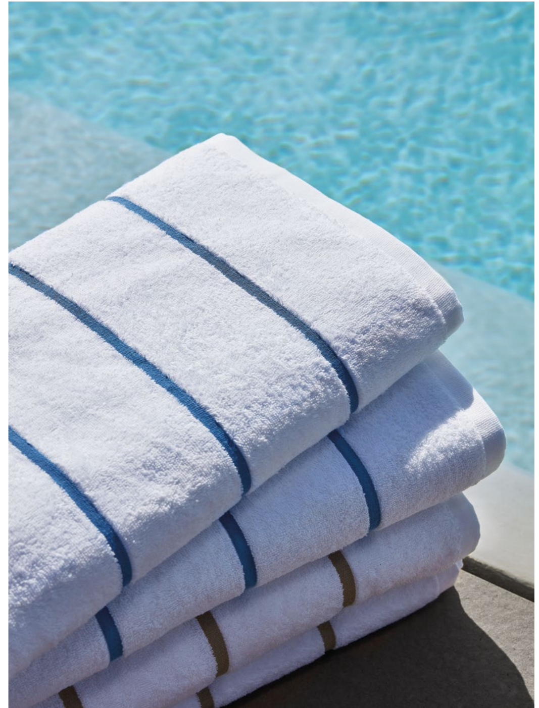
Striped Pool Towel, 100% Cotton, Pique Border, Double Twisted Terry. Beige Stripes and Blue Stripes colours.