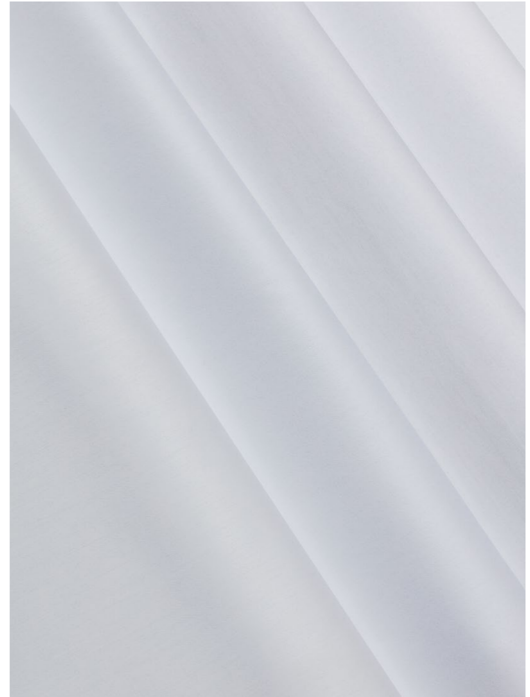
Mille Sateen, Plain Design, 100% Cotton, Mercerized. White colour.